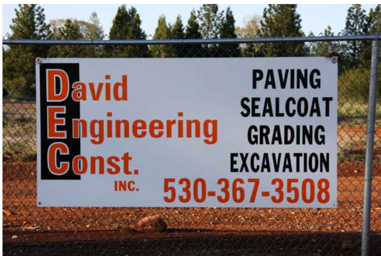
4x 8 Field Sign

For more information please contact Michelle Archbold at 530-367-2707